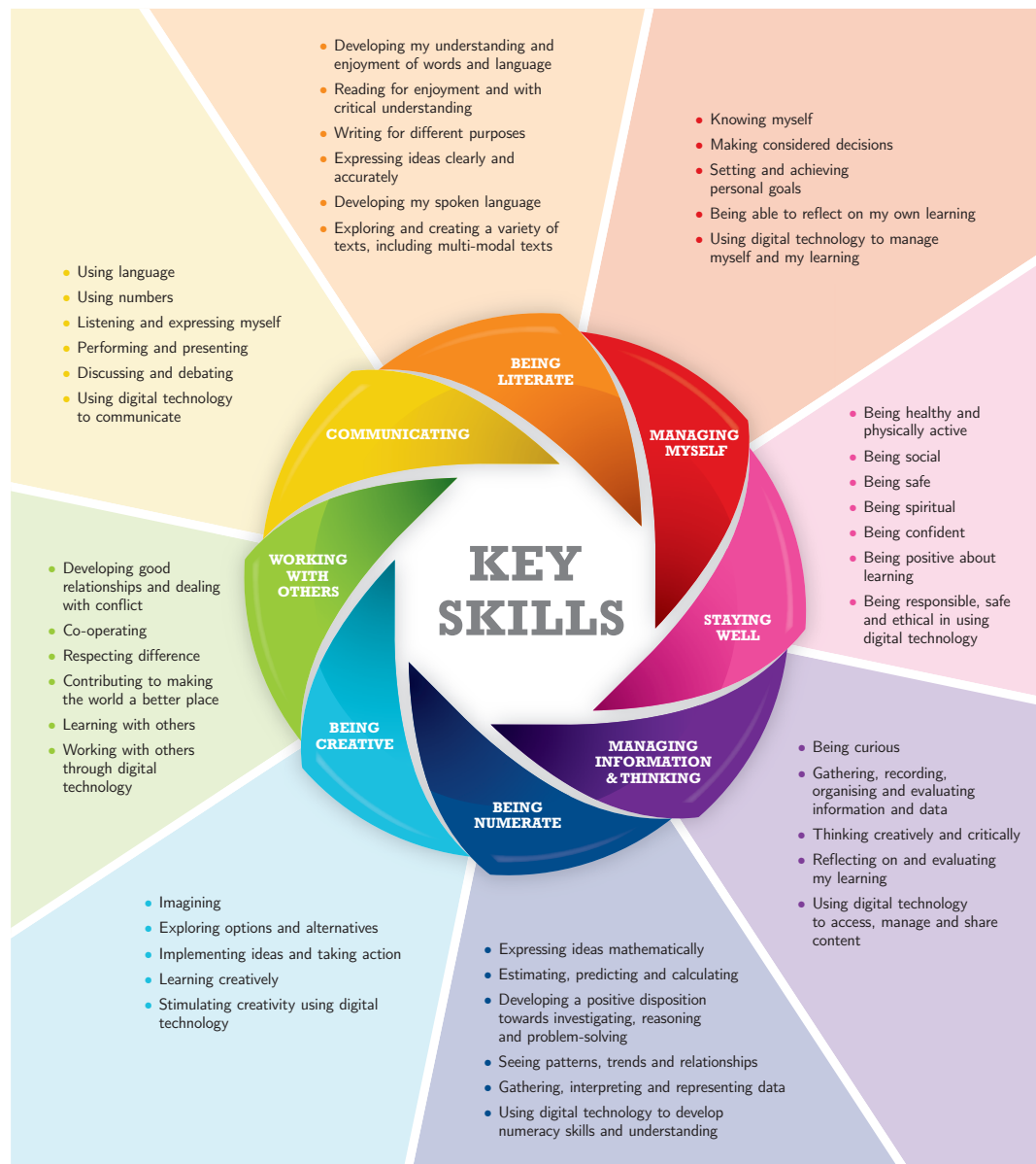
FIGURE 2: JUNIOR CYCLE KEY SKILLS

In addition to their specific content and knowledge, the subjects and short courses of junior cycle provide students with opportunities to develop a range of key skills. Figure 2 below illustrates the key skills of junior cycle. There are opportunities to support all key skills in this course but some are particularly significant.